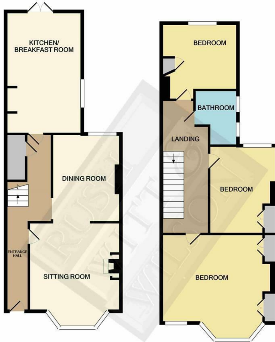
GROUND FLOOR APPROX. FLOOR AREA 550 SQ.FT. (51.1 SQ.M.)